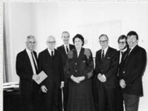
Children Nationwide (WellChild) et al