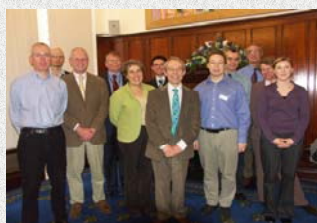
BPSU Executive circa 2006