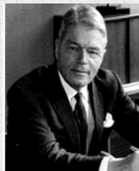
Sir Cyril Clarke